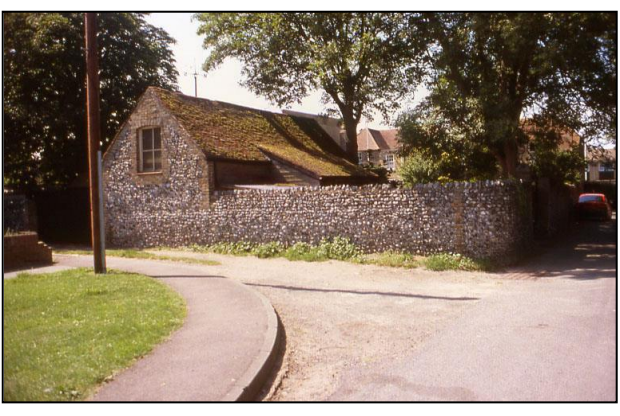
The Crispe Charity School Barn used by 1840